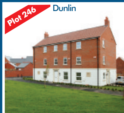
HOME OF THE WEEK 4 bed townhouse with garage £184,950