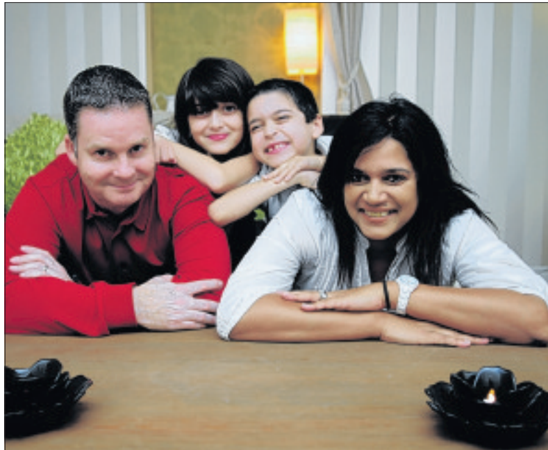
ENJOYING LIFE: The Mahers are glad they decided to relocate to Leicestershire

To find out more, call the sales hotline on 0844 811 5544 or visit: www.dwh.co.uk