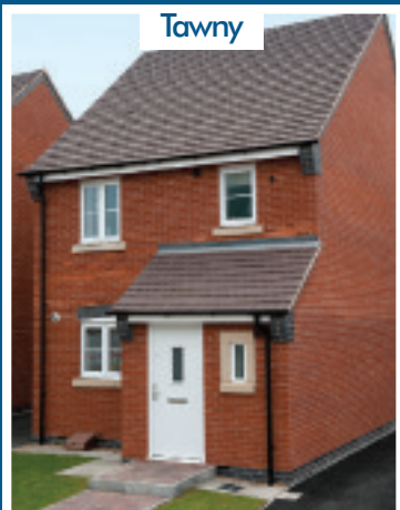
SHOW HOME FOR SALE 3 bed detached £159,950