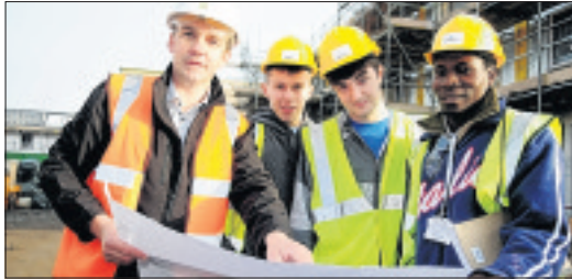
LEARNING: Construction students from Leicester College

Construction students from Leicester College have visited one of the biggest low-cost homes schemes in the city to learn about timber frame as part of their studies.