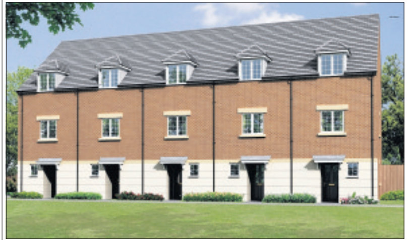
AVAILABLE: New homes ready to move into at under £105,000 at the Coalville development.